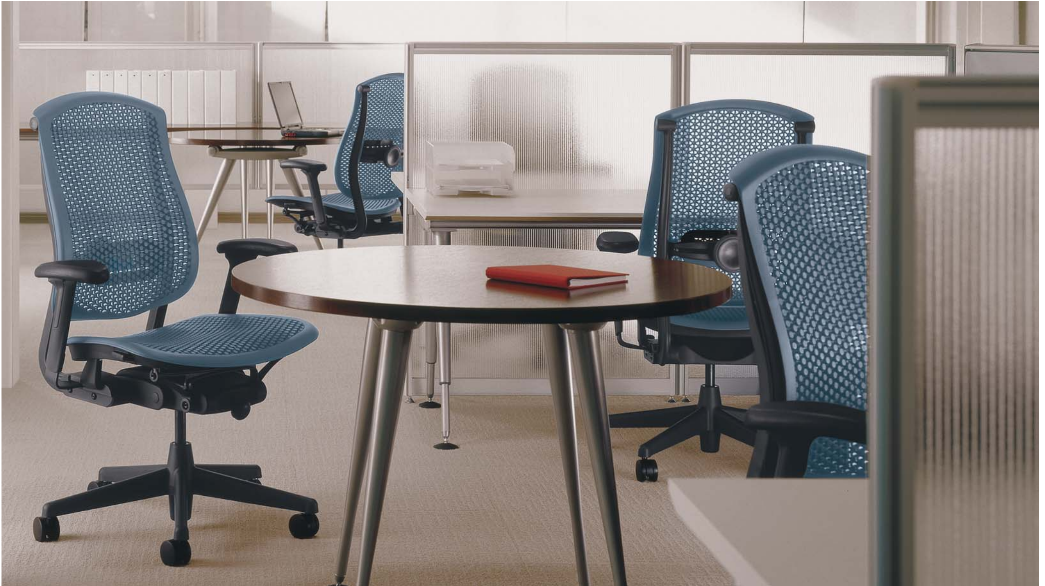
One chair size fits the 5th percentile female to 95th percentile male. And Celle meets ergonomic standards and codes worldwide. Shown in Blue Fog seat and back with Graphite base and frame.