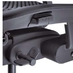
Full Range of Adjustments