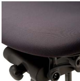
Multiple Fabric Options