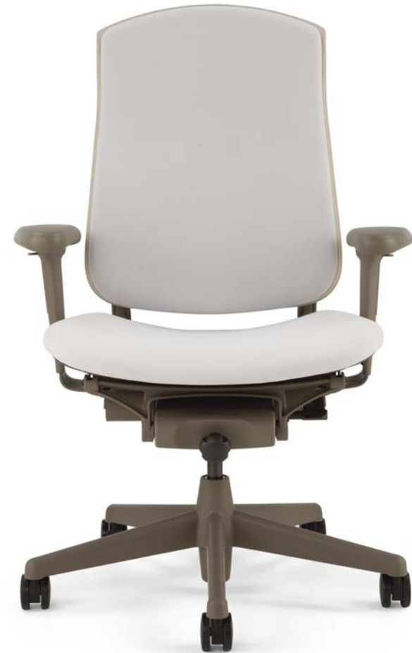
Celle fully upholstered

To complement the natural support of the Cellular Suspension, Celle incorporates Herman Miller's patented Harmonic tilt. The synchronous, calibrated mechanism lets you move naturally through the chair's wide 28-degree recline range. Without effort, you stay balanced and feel in control.